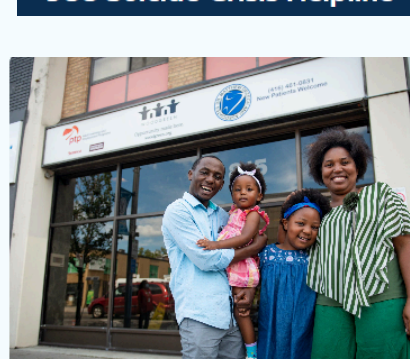
Toronto Health and Social Services Directory