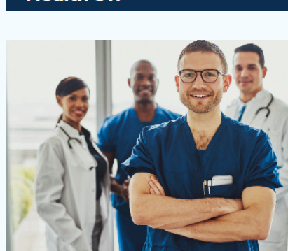
Find a Primary Care Provider